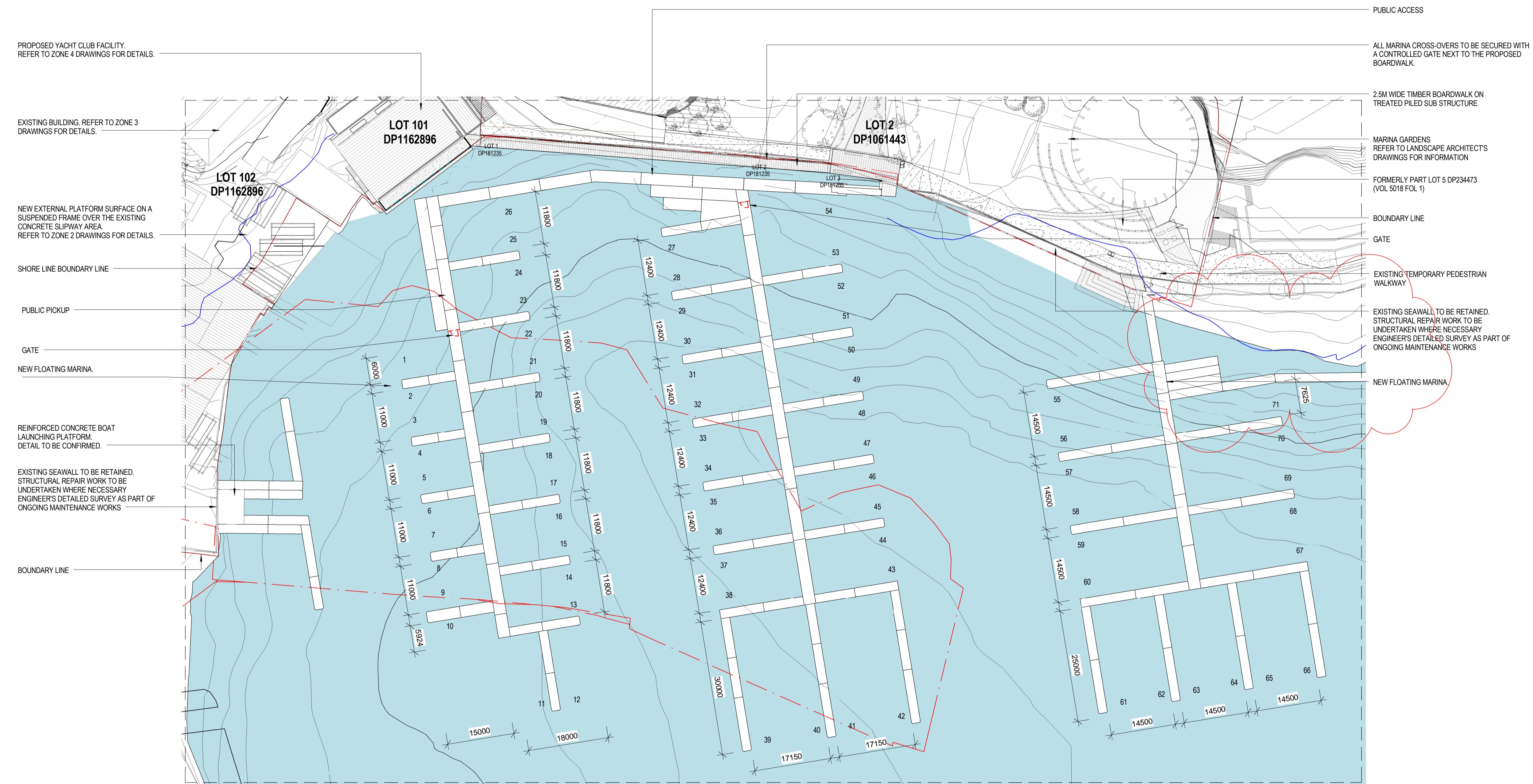
01A_PROPOSED MARINA PLAN ZONE 1A Scale: 1 : 500

BERTH NUMBERS ZONE 1A: 71 BERTHS RANGING IN VARIOUS SIZES UP TO 30m ZONE 1B: 13 BERTHS RANGING IN VARIOUS SIZES UP TO AGREED LARGE VESSEL SIZES INCLUDING RECONFIGURATION OF THE EXISTING DOLPHIN WHARF TOTAL BERTHING OF 84 VESSELS